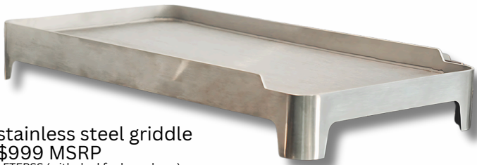
stainless steel griddle $999 MSRP LFTEPSS (with dual fuel purchase)