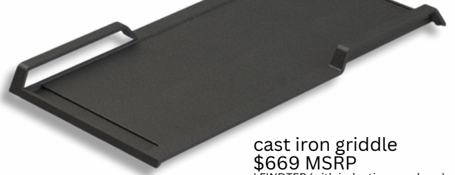
cast iron griddle $669 MSRP LFINDTEP (with induction purchase)