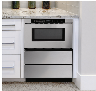
Optional Pedestal Accessory (SKMD24U0ES) Slides Under the Counter for Convenient Installation