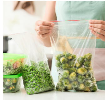
Steamer Bag Preset Easily Steams a Bag of Frozen Veggies up to 17oz