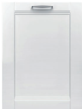
SHV78CM3N Custom Panel

PowerControl™ spray arm targets your dirtiest dishes with a deeper clean, no matter where you load them on the bottom rack.