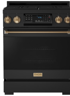
BRONZE RSG30B-BRZ / RSG30BLP-BRZ