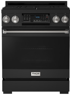
STAINLESS STEEL RSG30B-SS / RSG30BLP-SS