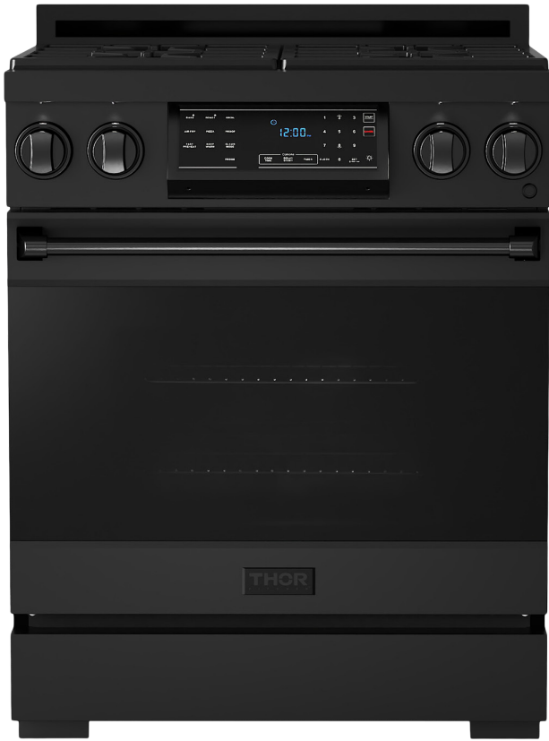
Product: Gordon Ramsay by THOR Kitchen 30 Inch Professional Gas Range with Tilt Panel Touch Control In Matte Black In Natural Gas/ Liquid Propane Model Number: RSG30B/RSG30BLP