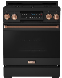
ROSE GOLD RSG30B-RSG / RSG30BLP-RSG