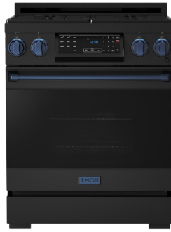
BLUE RSG30B-BLU / RSG30BLP-BLU