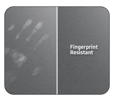
Fingerprint Resistant Finish