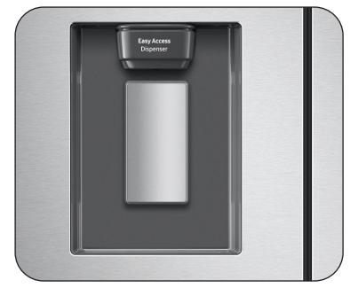
External Water Dispenser

Fingerprint Resistant Black Stainless Steel