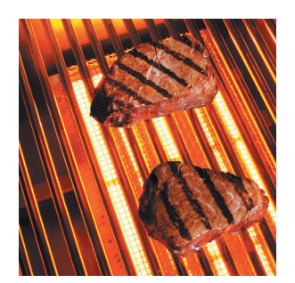
PROSEAR™ INFRARED BURNER

The Sedona by Lynx™ Series is always evolving to be the best at something new. That philosophy is reflected in its features. We've refined these features to give you a grilling experience that's both simple and stunning.