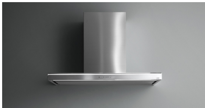
Photograph is for information purposes only May not correspond to the selected version