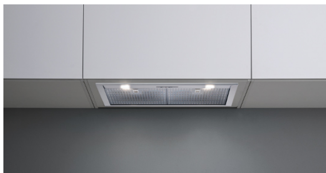
Photograph is for information purposes only May not correspond to the selected version