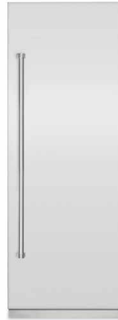
Shown with optional stainless steel door panel kit