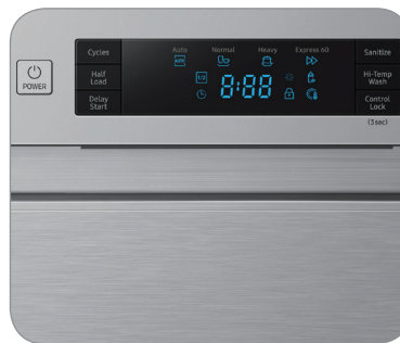
Easy control and accessibility