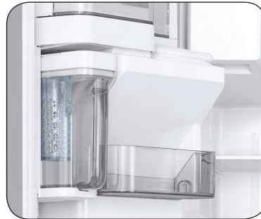
AutoFill Water Pitcher