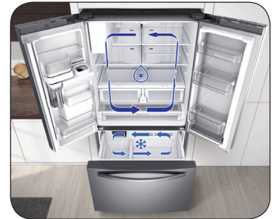
Twin Cooling Plus®